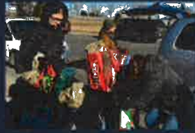
More support for struggling families