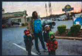
To Prevent Students from Homelessness