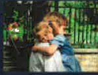
Students in Homelessness